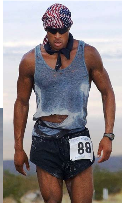
David Goggins the Ultra Athlete Ultraman Hawaii, 2nd, Total time of 24:41 Placing 1st in the Run

for energy electrolytes hydration endurance