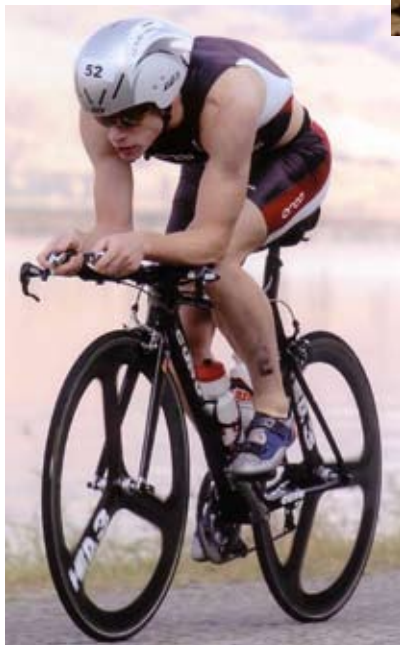
Scott Curry, Pro Triathlete 5th Overall, Ironman Canada, 2006 5th Overall, Ironman Florida, 2006

1 bottle of CarboPro 1200 = 8 bottles of other sports drinks or 12 gels Each bottle has SIX 80 mL servings One serving = 200 calories of pure energy from 50 grams of carbs per serving Each SERVING contains 5 grams of Ribose 5 grams of Trehalose 5 grams of Dextrose and 35 grams of CARBO-PRO™ 150 mg Sodium and 100 mg Potassium