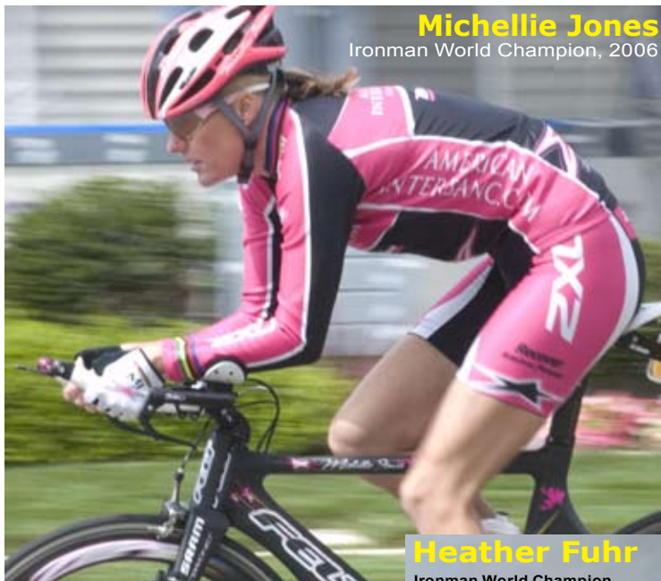
Michelle Jones Ironman World Champion, 2006