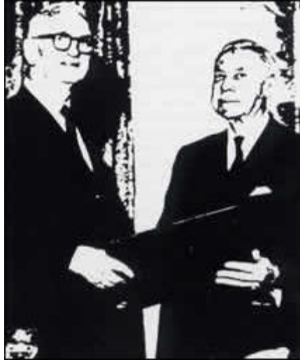
Dr. Ewen Cameron (left) receiving the Canadian Mental Health Award, 1966.